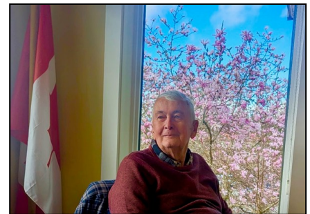
Enjoy the view of the magnolia tree