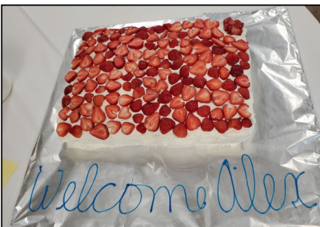
The beautiful and delicious cake