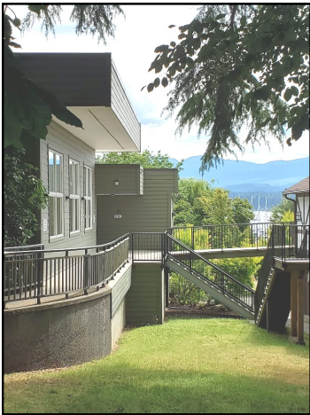
Summer at the Centre