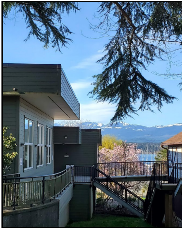
Spring has sprung at the Centre!