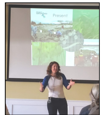
March's Kus-kus-sum Presentation

Information Sessions are provided solely for informational and educational purposes and are not intended to be an endorsement of any particular product, service, or business.