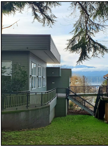
Come in out of the rain!