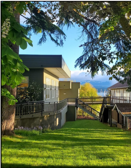
Our beautiful Centre