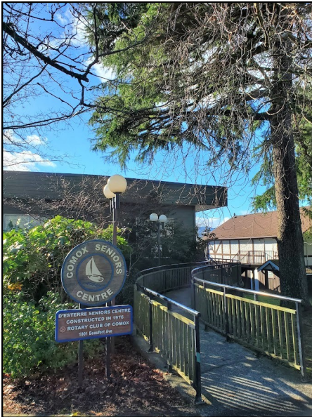
A rare January blue sky day