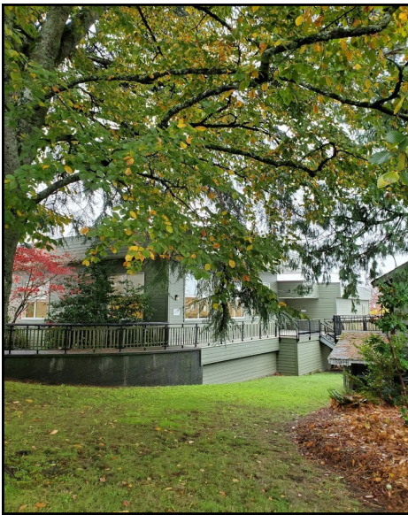
One of the few days without rain